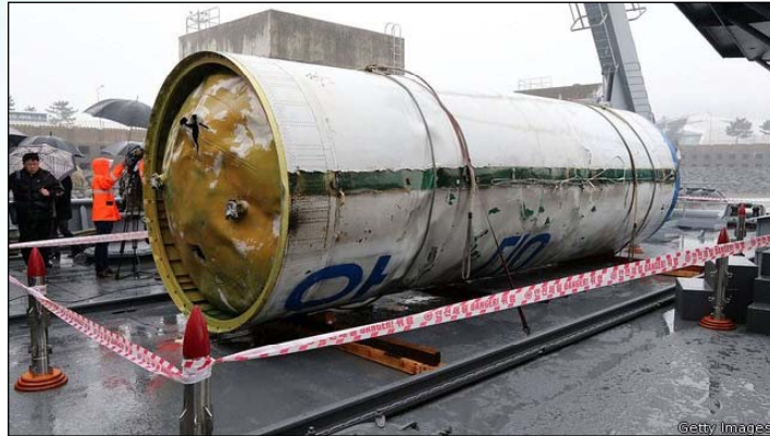
Part of Unha-3 first stage