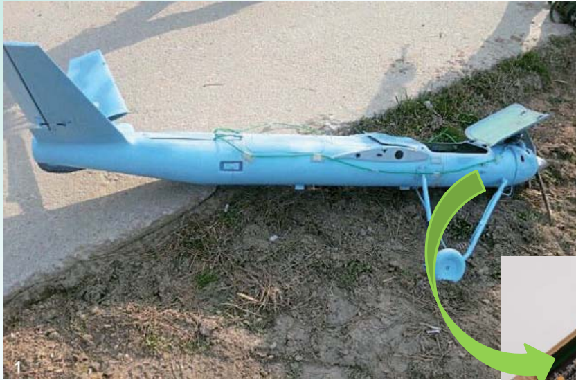
Crashed UAV in ROK